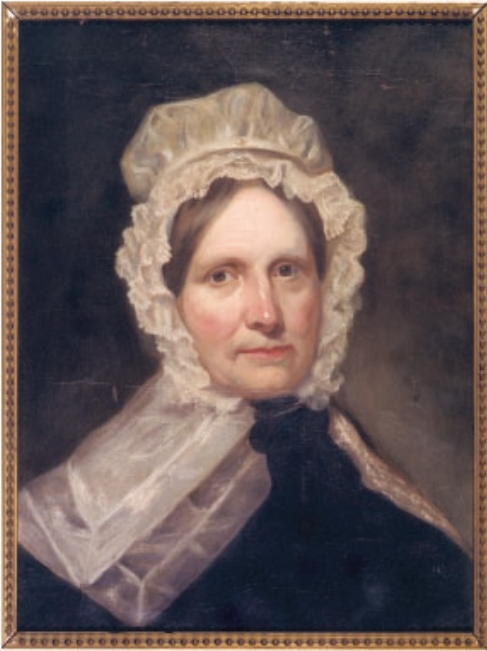
Figure 1. Portrait of Betsy Ross, by Samuel Waldo, 1832.