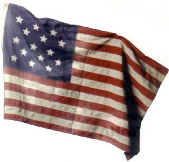
Figure 1. Replica of the 15-star / 15-stripe flag of the U.S. 3

The ambitions in question here—the colonization of the American West—are unmistakably represented in L. Edward Fisher's painting entitled Lewis and Clark, 1804 .