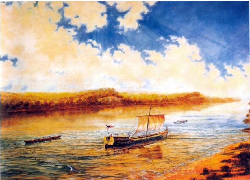
Figure 2. Up the Missouri 4

The ambitions in question here—the colonization of the American West—are unmistakably represented in L. Edward Fisher's painting entitled Lewis and Clark, 1804 .