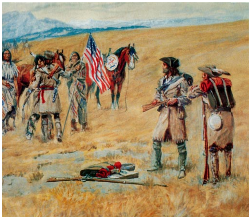
Figure 3. Meeting the Shoshone 10