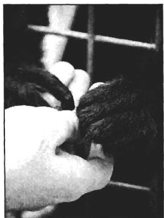
Christine M. Korsgaard examines what we owe to animals and the philosophical case for plant-based diets. Page 4