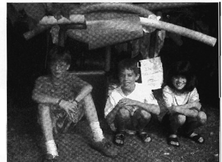
A business leader in the making? P. 11

"It's in the long-term interest of everyone to share productivity gains and to ensure they are broadly distributed." P. 31