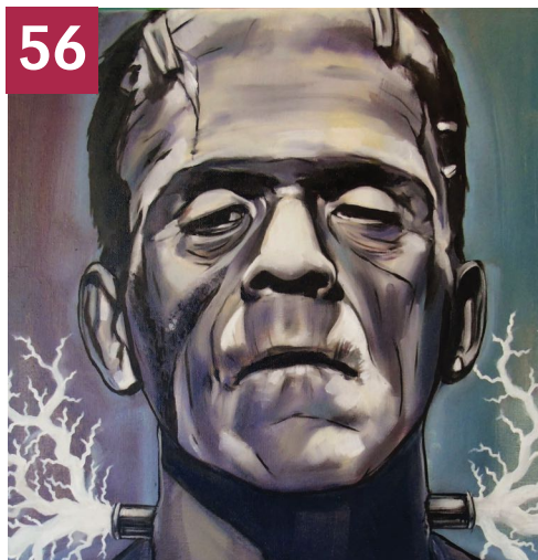
FRANKENSTEIN'S MONSTER BY WOODROW COWHER 2018