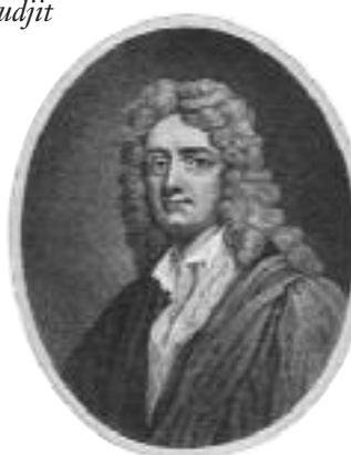
Are You Feeling Enlightened?