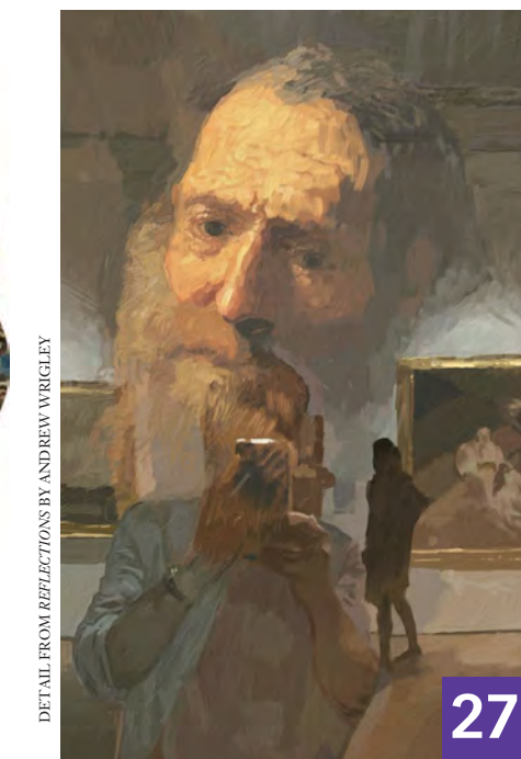
DETAIL FROM REFLECTIONS BY ANDREW WRIGLEY