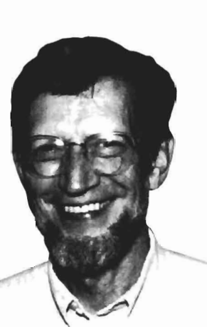
Alvin Plantinga: Gimme that old-time religion.