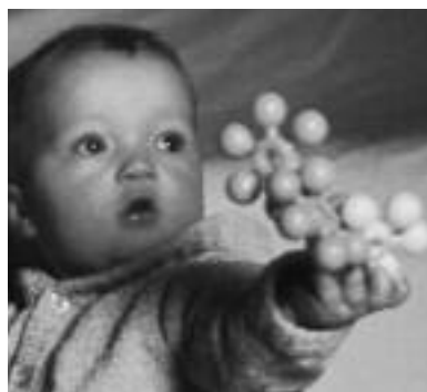
Choose your Genes Medical Ethics p.9, p.18, p.36

Philosophy Now is independent of all groups. It is published by :