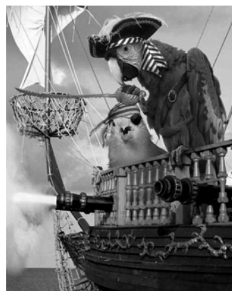
PIRATES BY MIDIAN OF THE INDEPENDENTS