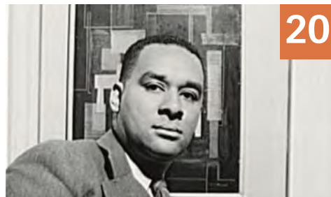
RICHARD WRIGHT BY GORDON PARKS