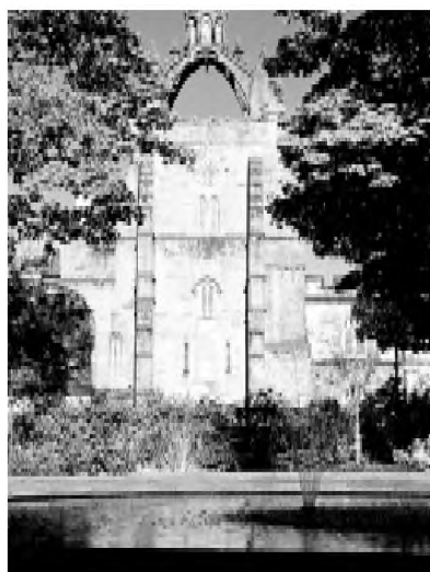
Aberdeen ahoy, p31

54 EXPLAINING ETHICS Simon Eassom Part four of the series introducing moral philosophy