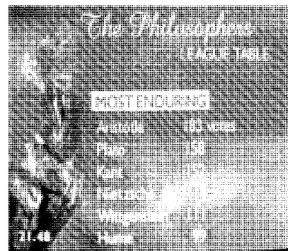
Hitting the headlines, p12