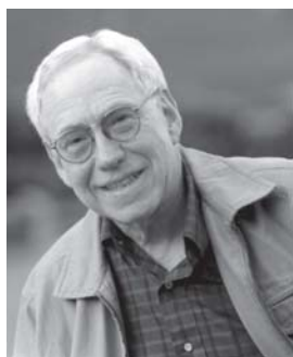
Hubert Dreyfus responds to John Searle's criticisms. Page 123