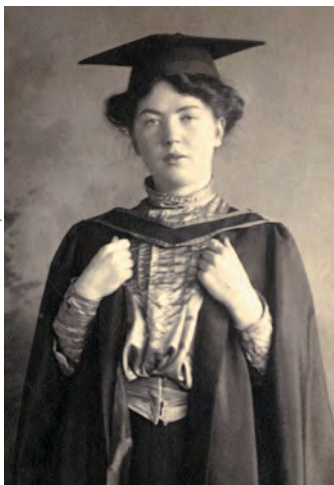
CHRISTABEL PANKHURST