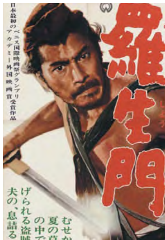
RASHOMON POSTER © DAIEI FILM 1962