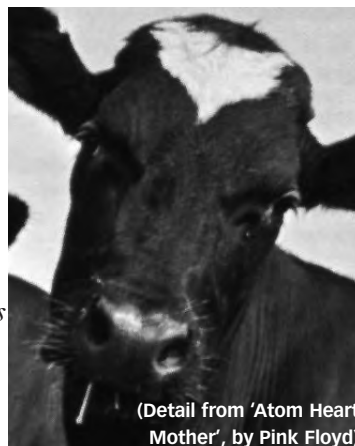
(Detail from 'Atom Heart Mother', by Pink Floyd)

Weapons research, music, particles, genius, progress & death. Pages 6-24