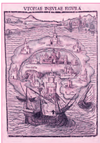
PLATE FROM 'UTOPIA' BY THOMAS MORE, 1516