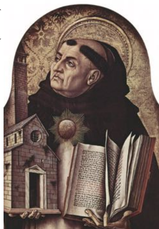
ST THOMAS AQUINAS ON ALTARPIECE BY CARLO CRIVELLI (15TH C.)

Looks Familiar? art, biology and identity p.18