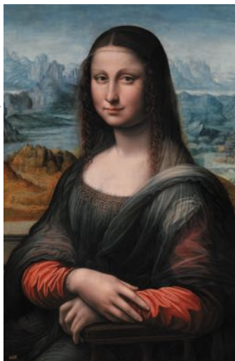
MONA LISA'S SISTER BY A PUPIL OF LEONARDO'S, IN THE PRADO

Science buddy, can you spare a paradigm? p.6 onwards