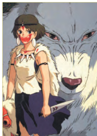
PRINCESS MONONOKE IMAGE © STUDIO GHIBLI 1997