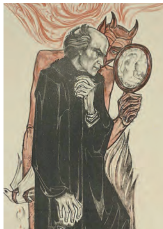
FAUST WITH MEPHISTOPHELES BY HARRY CLARKE