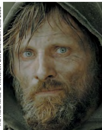
THE ROAD IMAGE © WEINSTEIN CO./DIMENSION FILMS 2009