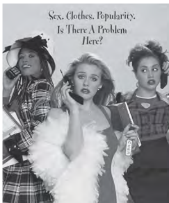
CLUELESS POSTER © PARAMOUNT PICTURES 1995