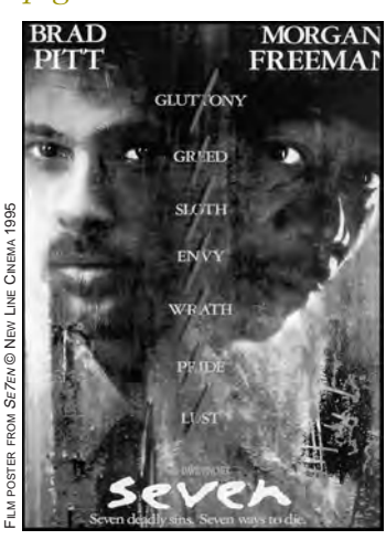
Se7en Just when you thought it was safe to sin page 42