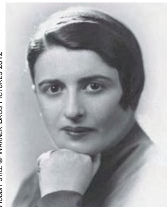
HOBBIT STILL