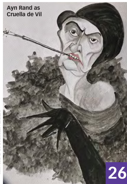
Ayn Rand as Cruella de Vil