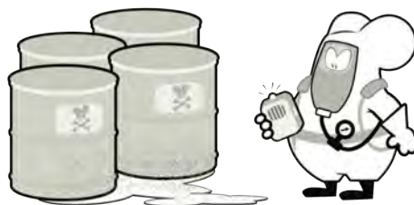
MOUSE BY MIMOOH 2013 CREATIVE COMMONS 3