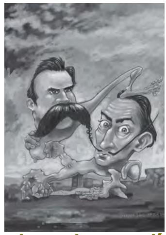
Nietzsche & Dalí