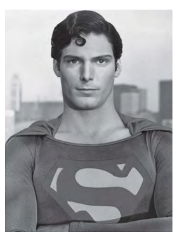
Altruism, or not? Self-interest, p.30 Books, p.46