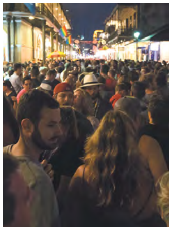
NEW ORLEANS PRIDE © TONY WEBSTER 2016