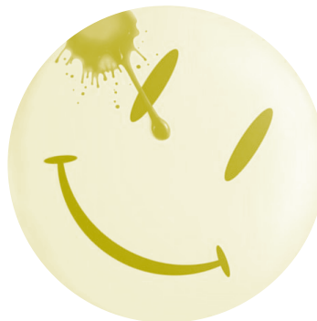
WATCHMEN SMILEY © DAVE GIBBONS/DC COMICS 1987