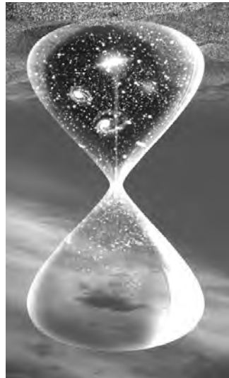
TIME & ETERNITY GRAPHIC