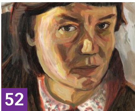
IRIS MURDOCH