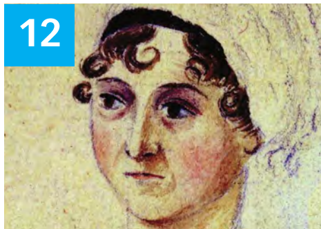
Jane Austen by her sister Cassandra Austen