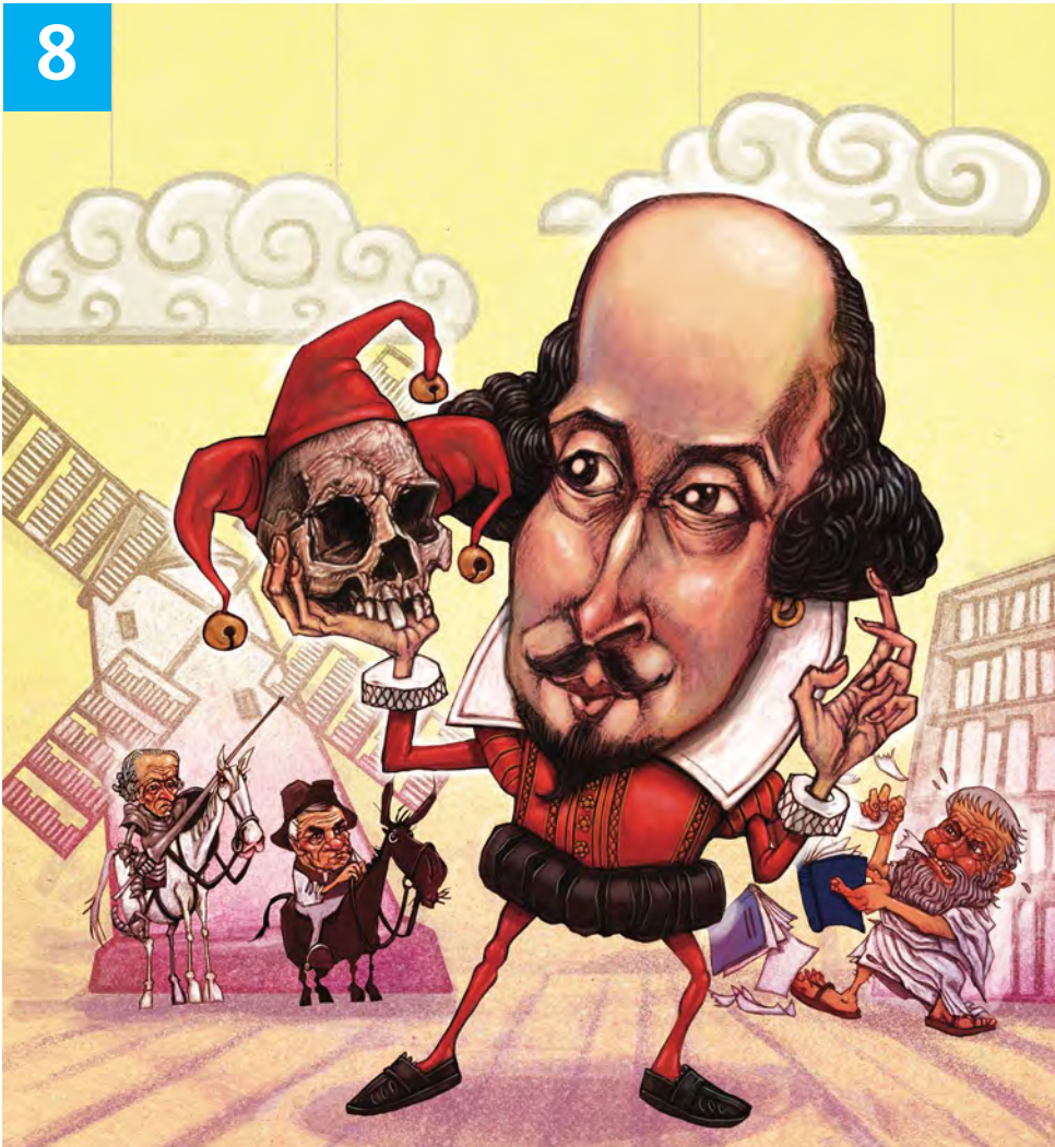
FRONT COVER ART BY STEVE LILLIE