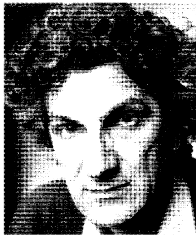
The prisoner, p13