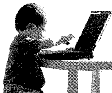
Teaching thinking, p11