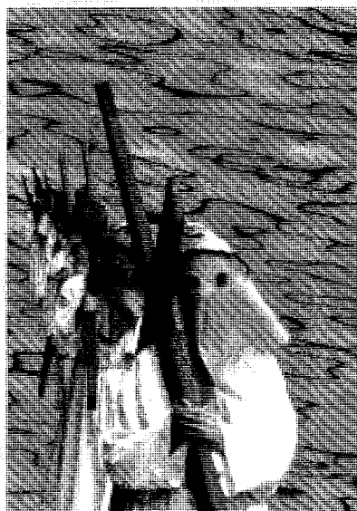
Picture: Penitents, Easter procession, Balmaseda, Basque Country

A wide-ranging look at the sometimes uneasy relationship between faith and rationality. Full details on page 34