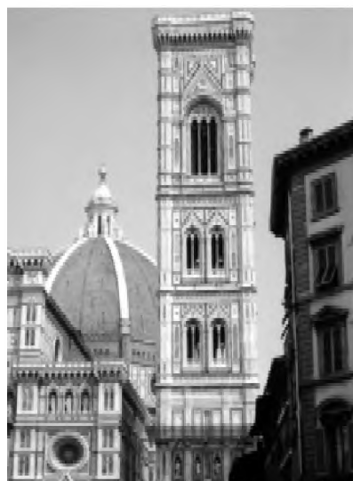
Madness in Florence, p30

30 MADNESS, SCIENCE AND SOCIETY From Florence, Italy