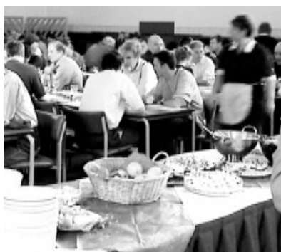
Conference briefing, p31