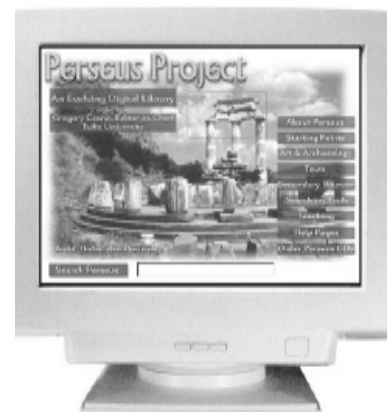
the internet, p29