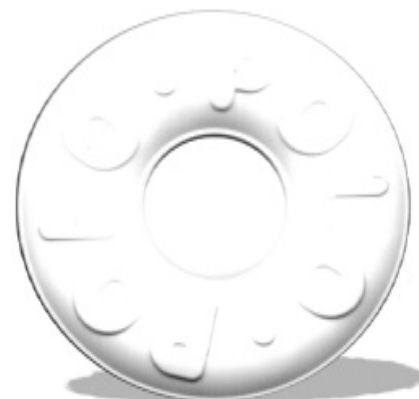
Hole lotta logic, p17

17 NEGATIVE FACTS Stewart Candlish When something which is not becomes something that is