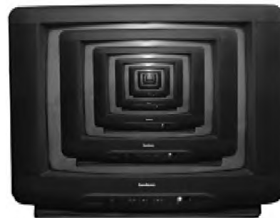
Postmodern encounters, p15