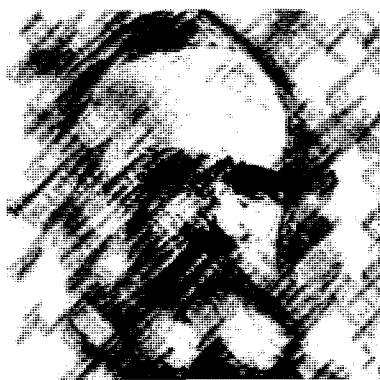
William James, p49